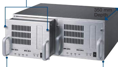
Dual Nodes Design

Thumb Screws to Fix The Sub-System in the Cage