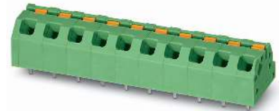
The figure shows 10-pos. standard item (without EX marking)

PCB terminal block, Push-in spring connection