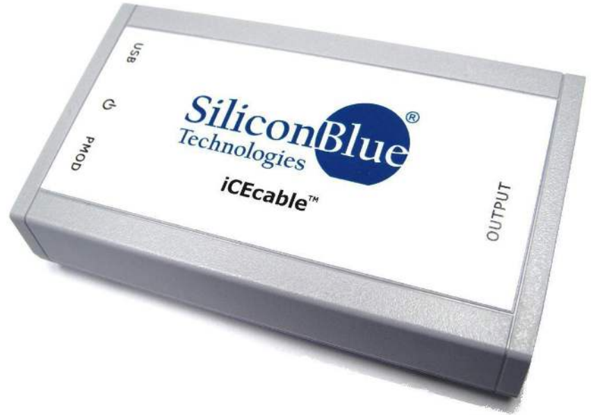
Figure 1: iCEcableM100-01