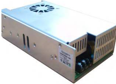
4"W x 7.01"L x 2.08"H