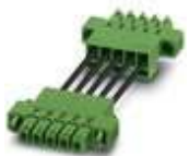
Spare local bus cable, for INTERBUS-ST modules