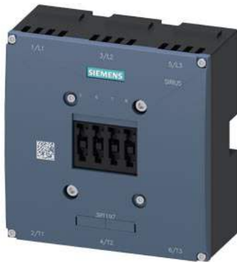
Arc chute for 3RT1076