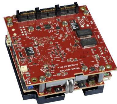
Inverted view showing stack-down 3-bank connector