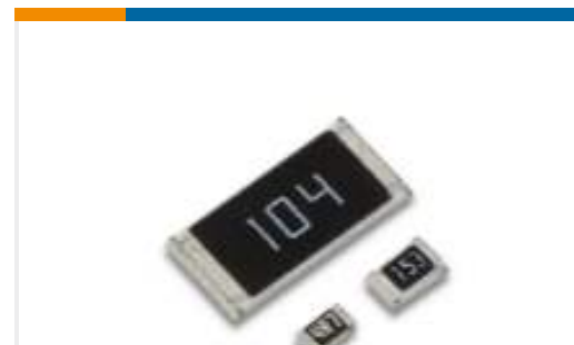
TE Part #5-2176343-3 CRGCQ 1206 220K 1%