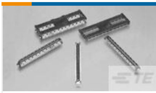
TE Part #3-6318490-6 .5FHR04H,220,S,GIG,08/Sn,HT,NSYes