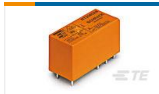
TE Part #4-1393240-0 RT334005