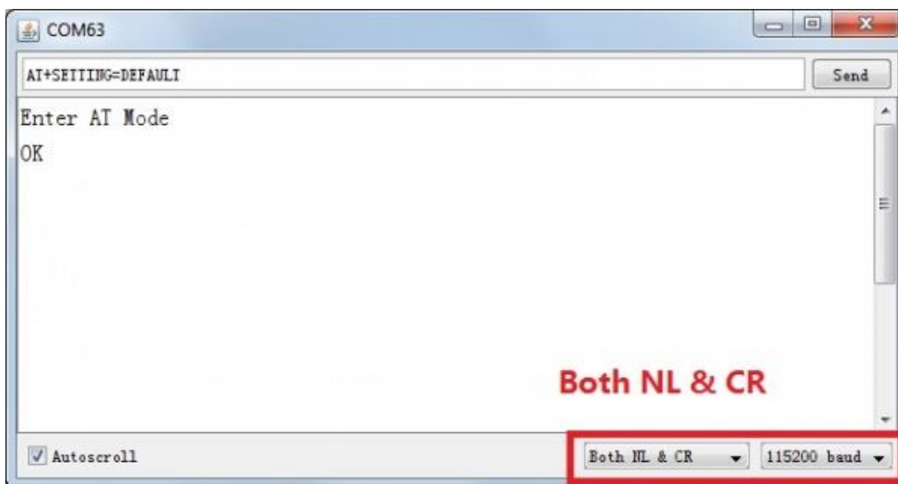
Fig1: enter the AT command, remember selecting the Both NL & CR