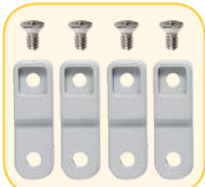
Comes with feet or flanges.

Our Premium Line enclosures are the most durable, non-metallic NEMA UL rated enclosures available. From the extremely versatile mounting options inside the enclosure to having the most off-the-shelf accessories, the Integra “Made In the USA” Premium Line enclosures provide great value to any application.