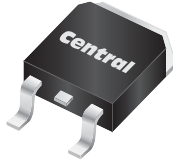
D 2 PAK CASE

SURFACE MOUNT SILICON CONTROLLED RECTIFIERS 12 AMP, 600 THRU 800 VOLT