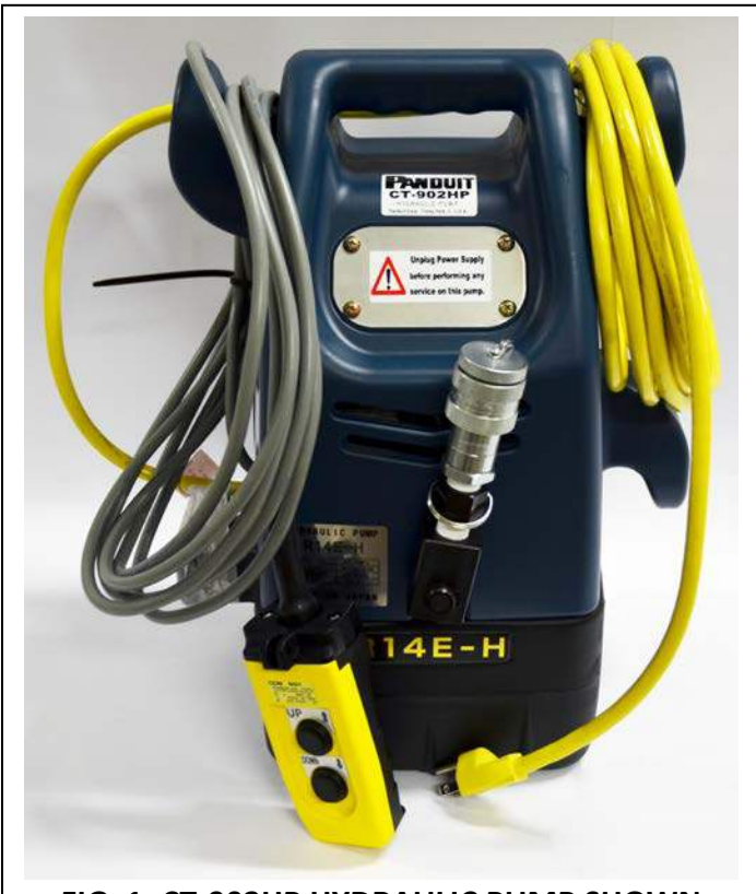
FIG. 1: CT-902HP HYDRAULIC PUMP SHOWN (WITH HAND PENDANT)