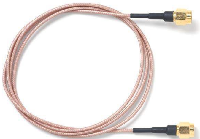
Model 4846-UU SMA Plug to SMA Plug, RG178B/U

Small size, and durability for confident connections