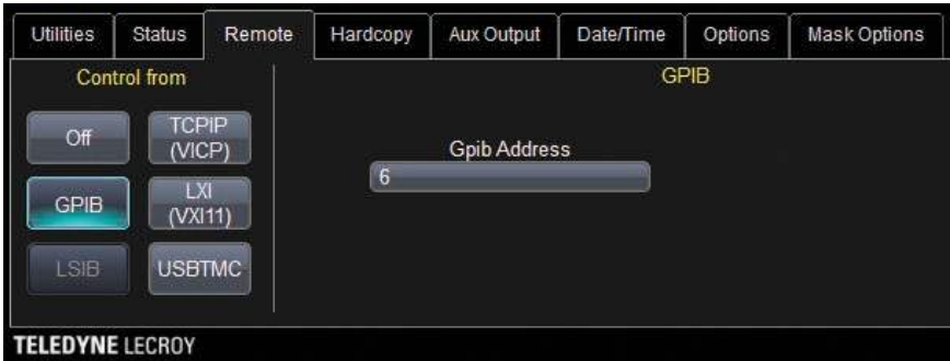
Figure 2 Remote Control Setup Screen of the WaveRunner 6 Zi