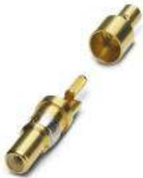
Coaxial contact, for D-SUB combination inserts, solder cup, pin, straight, for cable RG -178, gold-plated

Please be informed that the data shown in this PDF Document is generated from our Online Catalog. Please find the complete data in the user's documentation. Our General Terms of Use for Downloads are valid ( http://phoenixcontact.com/download )