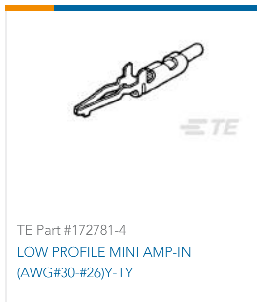
TE Part #172781-4 LOW PROFILE MINI AMP-IN (AWG#30-#26)Y-TY