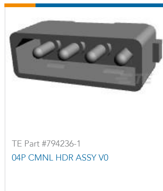
TE Part #794236-1 04P CMNL HDR ASSY V0