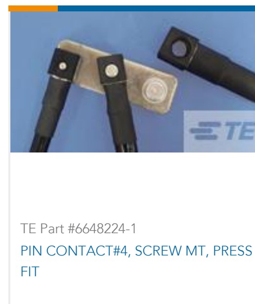
TE Part #6648224-1 PIN CONTACT#4, SCREW MT, PRESS FIT