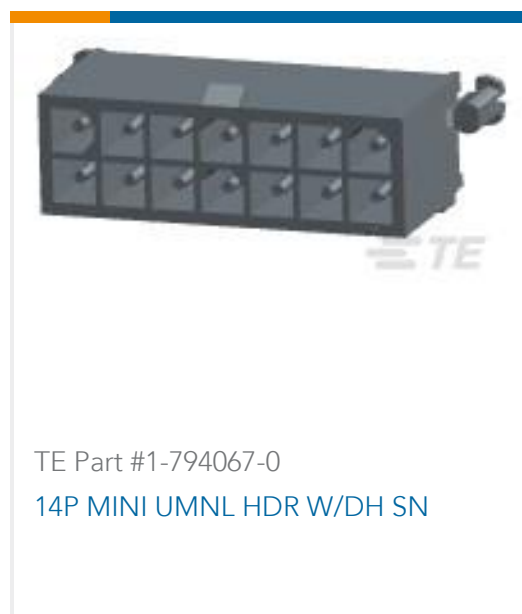
TE Part #1-794067-0 14P MINI UMNL HDR W/DH SN