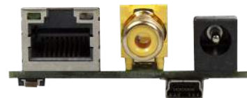
eCAM-BF connector view

BLUETECHNIX Mechatronische Systeme GmbH Waidhausenstraße 3/19 | 1140 Wien, Austria +43 (1) 9142091 x 0 | +43 (1) 9142091 x 99 www.bluetechnix.com | office@bluetechnix.com