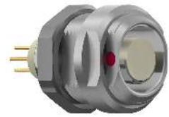
PANEL CUT OUT: