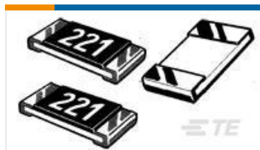
TE Part #2-1622820-0 3520 1R5 5%