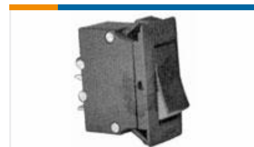
TE Part #1-1423673-2 W51-A122B1-10=CKTBKR,THERM,ROC