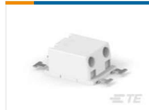
TE Part # 2834334-2 4.0PITCH ITB CONN_2P_W CAP_NATURAL