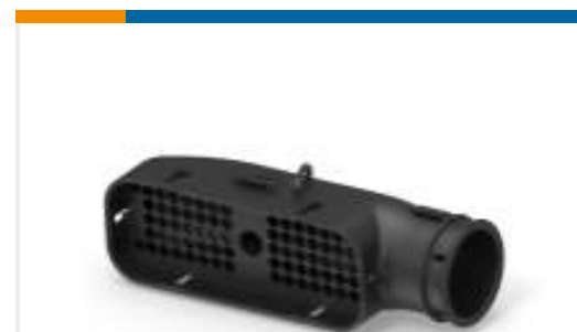
TE Part #0528-012-7005 BKSHL, 70P, BLK, PLG, RA, NO RIB, NW 26