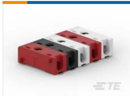
TE Part # CAT-B8519-P7565 Poke-In Connector, BUCHANAN WireMate