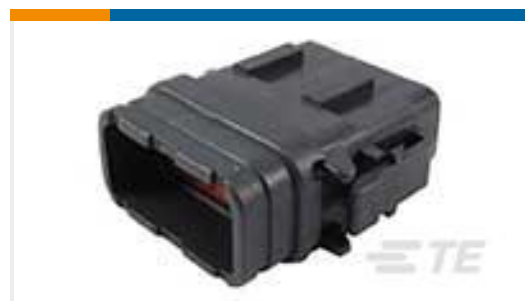
TE Part #DTM06-12SB-E007 PLG, 12P, BLK, N, XCAP, B