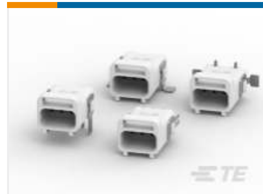
TE Part # CAT-SL36-M6642B Miniature Headers, SlimSeal