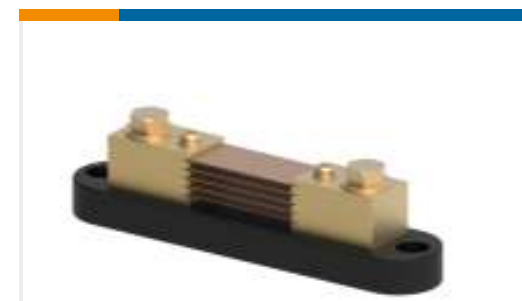
TE Part #CG3283-000 CI-FN5050