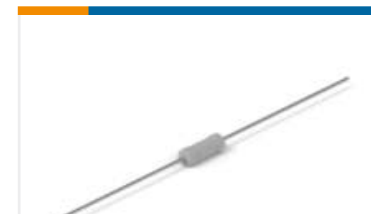
TE Part #1-1676123-2 1/2W SM M/OX 5% 2R4