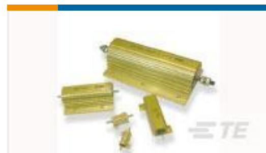
TE Part #1-1625999-1 HSC100 1K2 5%