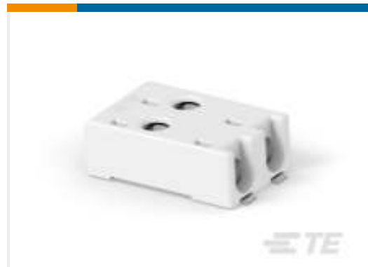
TE Part # 2834385-2 RELEASE POKE-IN CONNECTOR_2P_NATURAL