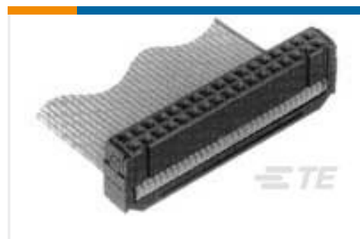
TE Part #1658623-1 10 NOVO MIL 30DP, LEAD FREE