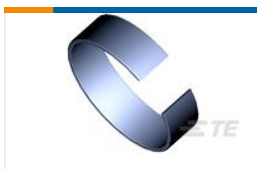
TE Part #745508-1 FERRULE SPLIT RING, HD