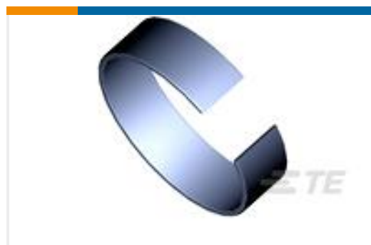
TE Part #745508-2 FERRULE SPLIT RING, HD