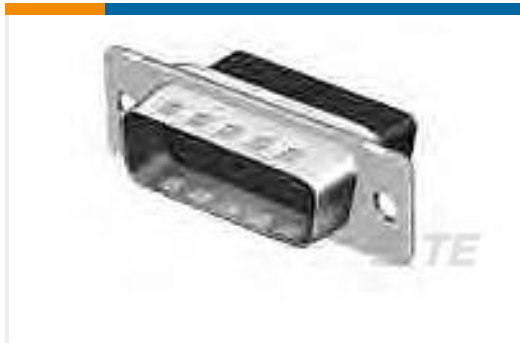
TE Part #207464-7 HDP-20, PLUG, SIZE 3, 25 POSN