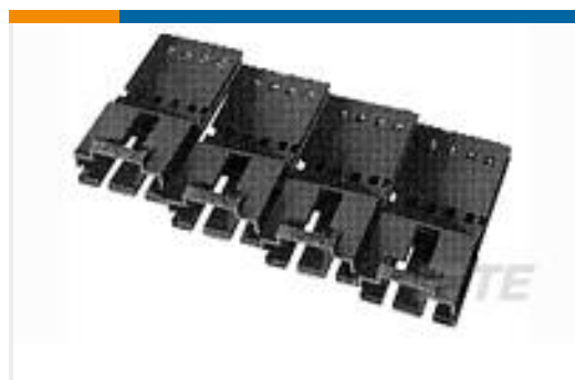
TE Part #103653-5 06 MTE SHRD PIN HSG SR LATCH