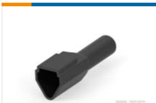
TE Part #DT3P-BT-BK BOOT, 3P, REC, ST, BLK