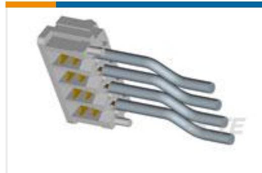
TE Part #173977-7 CT CONN MT REC ASSY 7P