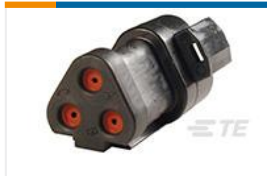
TE Part #DT04-3P-E005 REC, 3P, BLK, N, CAP