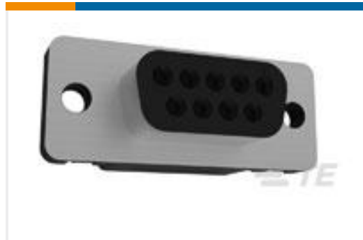
TE Part #1658610-4 09 POS HDF RCPT, MS, LEAD FREE