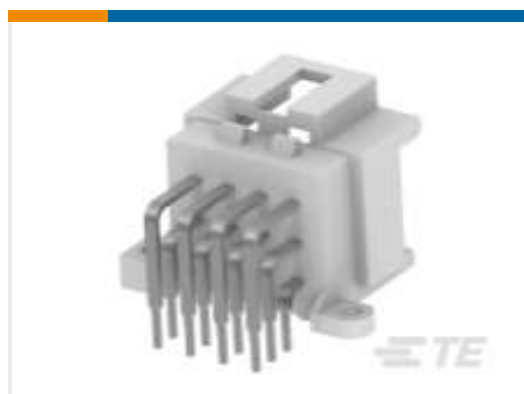
TE Part #1-966140-3 TAB HEADER 2.8 X 0.8MM 6-21 POS