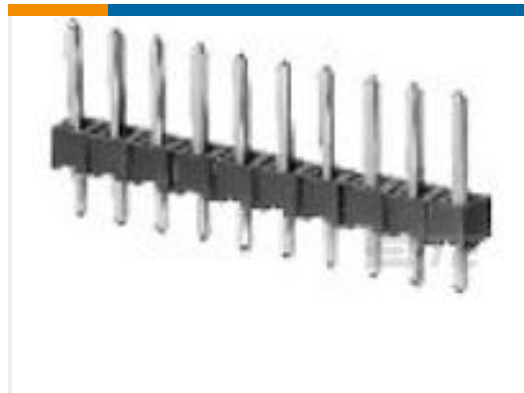
TE Part #5-146278-8 08 MODII HDR SRST B/A .100CL