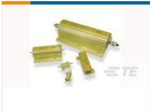
TE Part #1-1625999-5 HSC100 1R5 5%