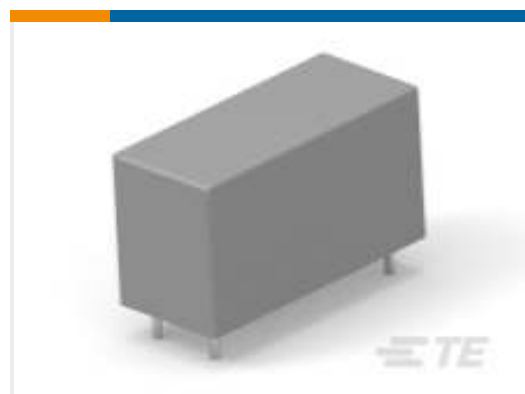
TE Part #2-1649326-2 RTB34012