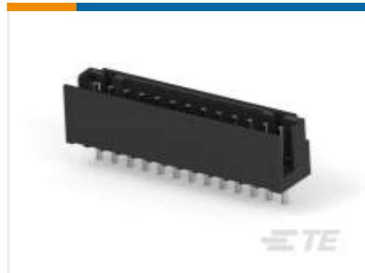
TE Part #1-292132-5 CT 2mm Post Header Asmbly: Box V DIP