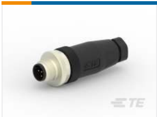
TE Part #T4111501051-000 M12,MALE,STRAIGHT,D CODE,5P, PG7,GOLD