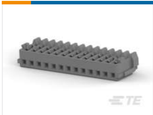
TE Part # 1-353293-3 MINI CT MT REC ASSY 13P GRAY