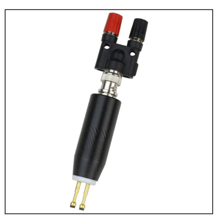
Figure 1. Desco 19297 Two-Point Resistance Probe