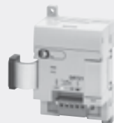
DeviceNet I/O Link Unit CPM1A-DRT21