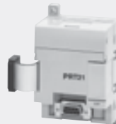
PROFIBUS-DP I/O Link Unit CPM1A-PRT21