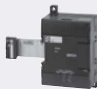
CompoBus/S I/O Link Unit CP1W-SRT21