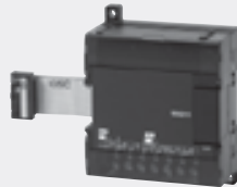
Analog I/O Unit CP1W-MAD11

Analog inputs: 2 (resolution: 6,000) Analog outputs: 1 (resolution: 6,000)