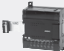
Analog Input Unit CP1W-AD041