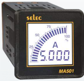
48 x 48mm