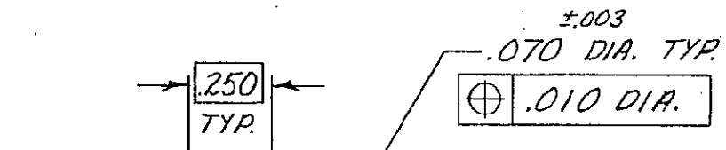
RECOMMENDED HOLE PATTERN FOR 1/8" THK. P.C. BOARD