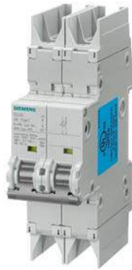
Circuit breaker 10kA, 2-pole, D, 8A according to UL 489-480Y/277V