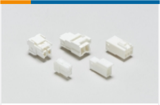
Rectangular Power Connectors(169)