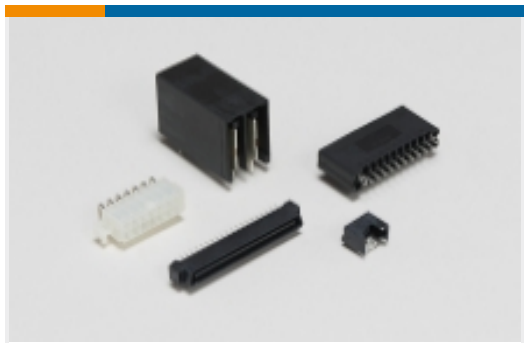
Standard Rectangular Connectors(7)