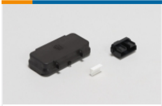
Rectangular Caps & Covers(2)