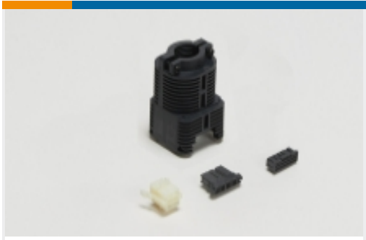
Rectangular Connector Housings(11)