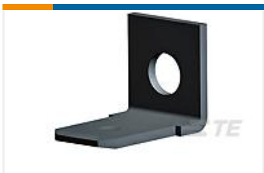
TE Part #63971-1 250 FASTON TAB TPBR