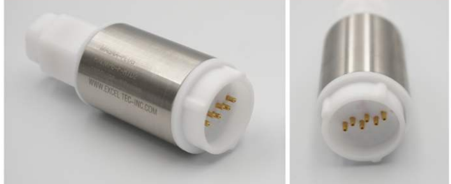
MP6-F-RTD2 Female connector – 6 sockets