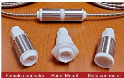
Female connector Panel Mount Male connector