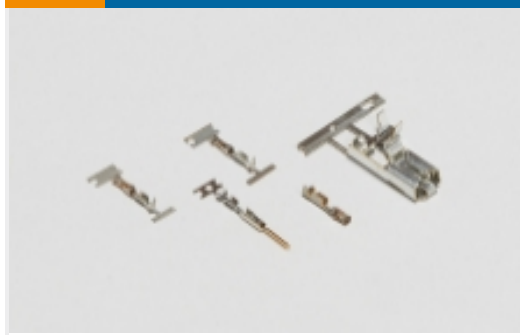
Wire-to-Board Connector Contacts(1)