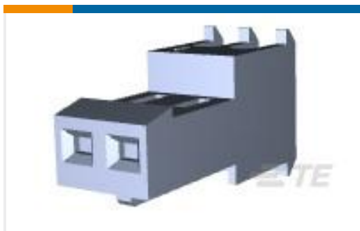
TE Part #3-641656-2 02P MTA100 CONN ASSY GRN LF