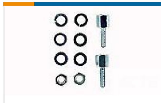
TE Part #5205817-2 FEMALE SCREWLOCK KIT,BULK PKG