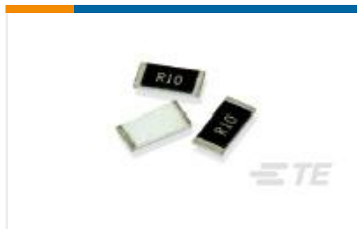
TE Part #4-2176057-9 RLP73K 3A 1R0 1% 1K RL