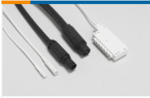
Lighting Cable Assemblies(2)