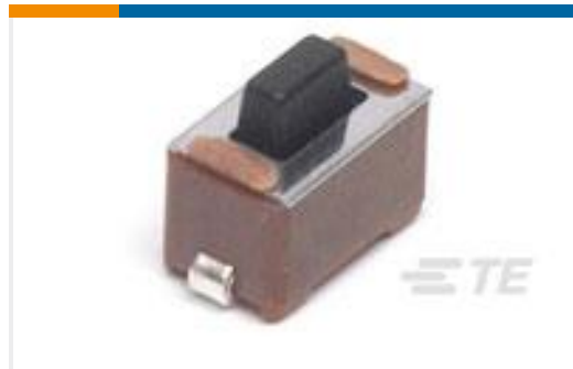
TE Part #147873-2 SWITCH,TACT,SMT,J-LEAD,4.3MM