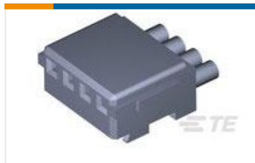
TE Part #2058943-3 Cable Assembly Mini CT 4 pos.