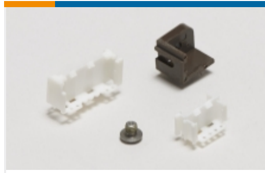
PCB Connector Mounting(10)