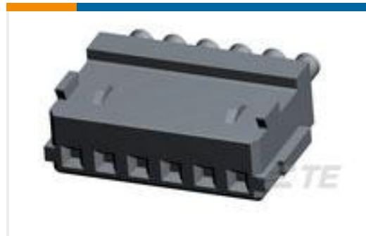
TE Part #2058943-5 Cable Assembly Mini CT 6 pos.