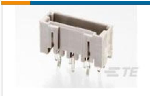
TE Part #292207-5 MINI CT SGL DIP V 5P NAT