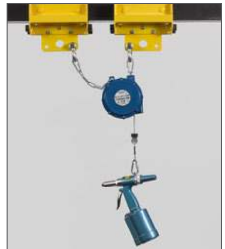
Portable Tool Support Applications