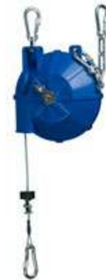
AB Model, Rear View