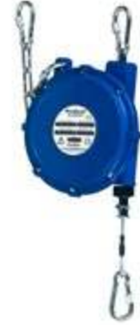
AB and ABRL Model, Front View