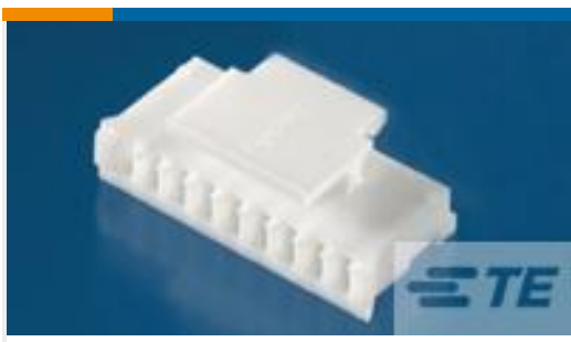
TE Part # 1-1735447-4 HPI 2.0 RECEPTACLE HOUSING, 14P