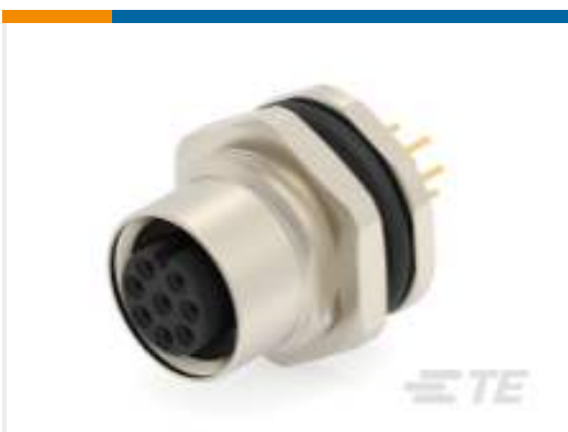
TE Part #T4141012081-000 M12,REAR MOUNT,FEMALE,A,8P, SOLDER PCB