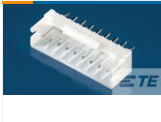
TE Part #1-1735446-2 2MM PITCH HPI POST HEADER, VERTICAL, 12P