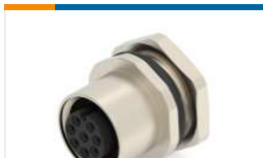
TE Part #T4133012081-000 M12,FRONT MOUNT,FEMALE,A,8P, SOLDER WIRE