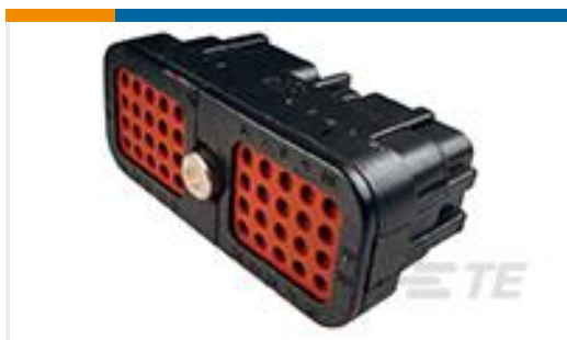
TE Part #DRC26-40SA PLG, 40P, BLK, A