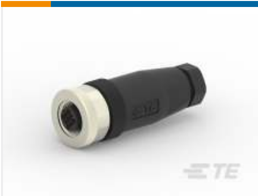
TE Part #T4110001031-000 M12,FEMALE,STRAIGHT,A CODE,3P, PG7,GOLD