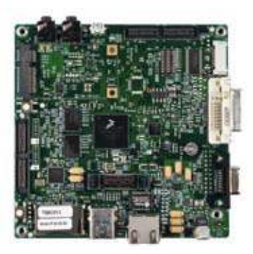
i.MX51 Evaluation Kit