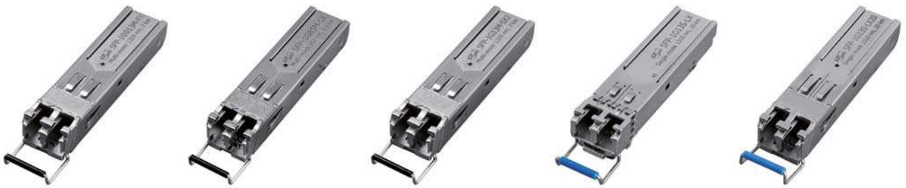
SFP-100M13M-FX SFP-1G85M-SX SFP-1G13M-SX2 SFP-1G13S-LX SFP-1G13S-LX20