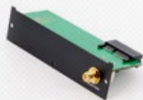
WLAN expansion card