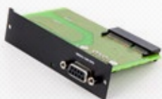
Low cost serial card