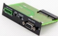
Industrial serial card