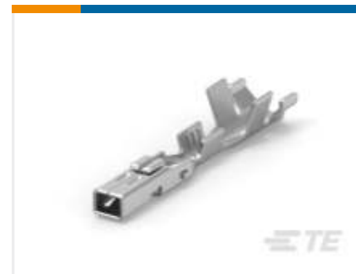
TE Part #2329915-1 Power Versa-Lock RECPT, 22-26 AWG