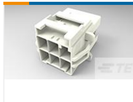
TE Part #1-1971775-3 PTL 2X3 CAP PANEL MT STD TEMP KEY A NAT