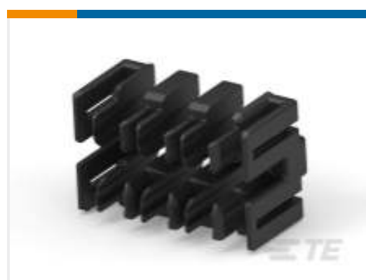
TE Part #2337218-6 Power Versa-Lock TPA, 2X3