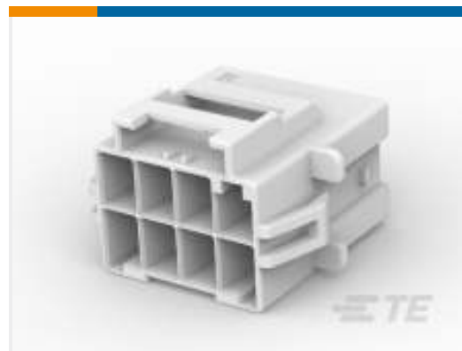
TE Part #1-1971772-4 Standard Temperature Caps | POWER TRIPLE LOCK