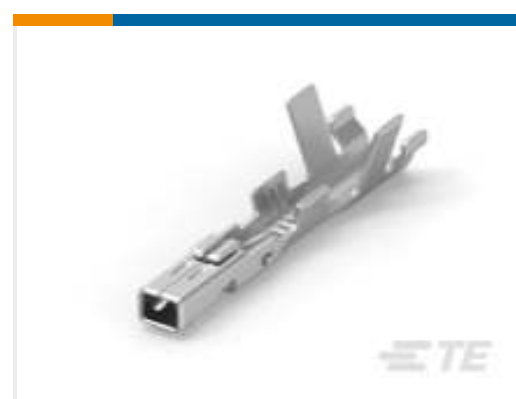
TE Part #2329912-1 Power Versa-Lock RECPT, 18-20, 2X22 AWG