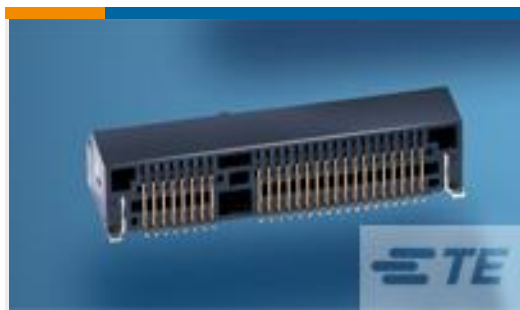
TE Part #2041262-1 Mini PCI-E 6.8H G/F