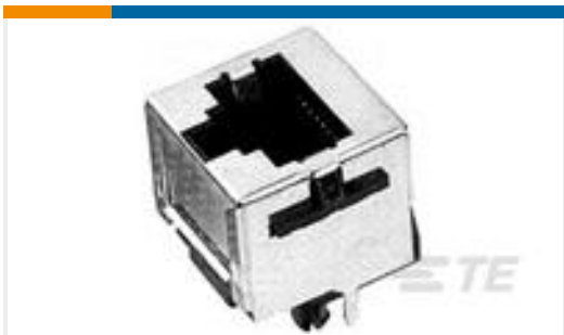
TE Part #1734577-4 MOD-JK,8P8C,SHD W/LED, G/Y,50U"