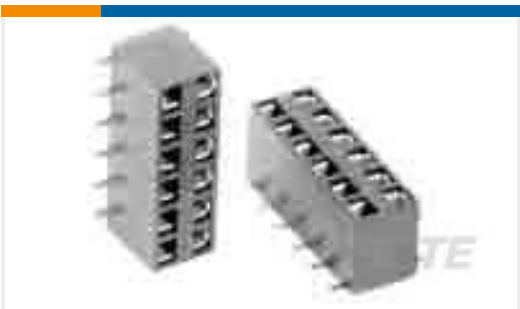
TE Part #969973-6 2x6P HV100 REC. CON, SMD, GOLD, BLISTER