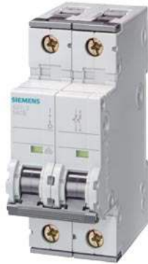
Miniature circuit breaker 400 V 10kA, 2-pole, C, 13 A, D=70 mm