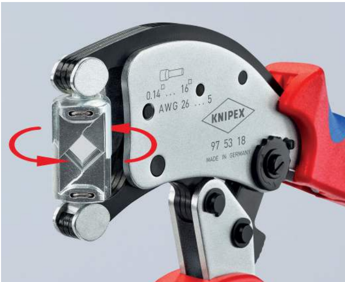
Crimp head can be rotated 360° for optimal accessibility, even in confined spaces