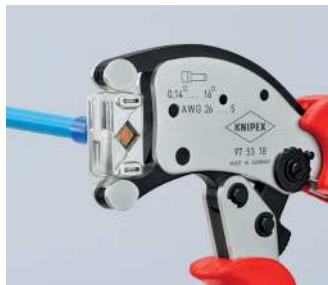
Uniquely flexible: connectors can be inserted in the rotatable crimp head from almost any position