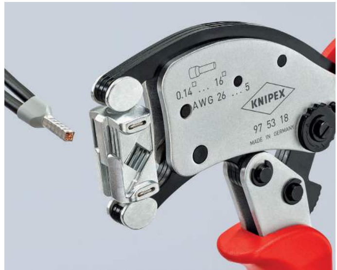
Twin end sleeves (ferrules) up to 2 x 6 mm 2 can be crimped without adjustment