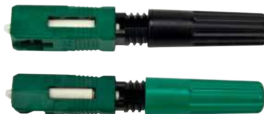
3M™ No Polish SC/APC Connector Flat and Angle Splice 1.6-3 mm Jacket