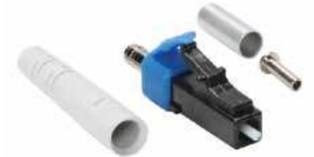
3M™ Hot Melt LC Connector