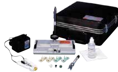
3M™ Multi-Fiber Splice Preparation Kit 2600

The Multi-Fiber Splice Preparation Kit 2600 provides the components required to assemble the multi-fiber splice. The 3M™ Ribbon Construction Tool 2670 provides organization and “ribbonizing” of individual 250 μm coated fibers prior to splicing. The tooling is designed to minimize the required tooling investment.