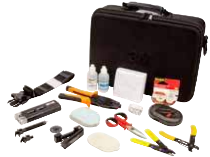
3M™ Crimplok™ Kit 6955 (components loaded in pouch)