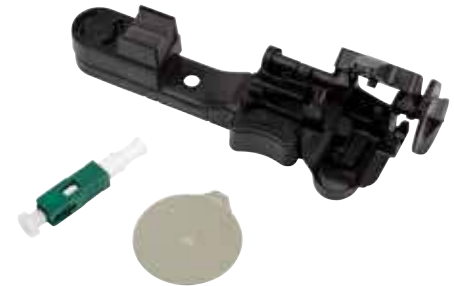
3M™ Crimplok™+ Activation Tool, a Singlemode SC APC 250/900um connector and a lapping film