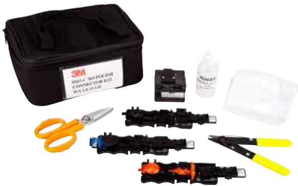
3M™ No Polish Connector Kit 8865-C