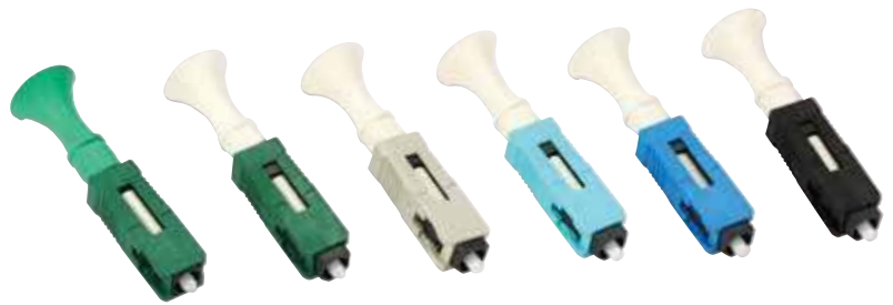
3M™ No Polish SC Connector Family