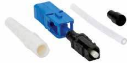
3M™ Epoxy SC Connector

3M Epoxy Connectors feature a pre-radiused, zirconia ceramic PC ferrule designed to provide contact of fibers for low reflection and low insertion loss. The 3M epoxy SC and FC connectors are intermateable within NTT specifications. These connectors are built to exacting ferrule length tolerances for maximum machine polish yield and bulk packaged to maximize factory cable assembly efficiency. 3M Epoxy Connectors can also be used with an anaerobic adhesive for fast-cure interconnect applications.