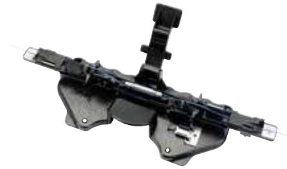
3M™ Fibrlok™ Angle Splice Assembly Tool 2501-AS