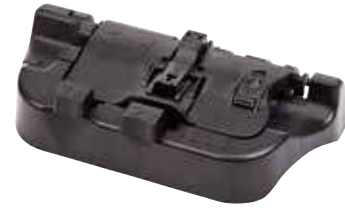
3M™ Easy Cleaver

Unlike other blade-enabled fiber cleaving tools, the 3M Easy Cleaver requires no maintenance because of its diamond wire cleaving mechanism. Use it to create smooth end-faces repeatedly – each tool performs up to 120 cleaves. See the ordering chart for specific details on packaging.