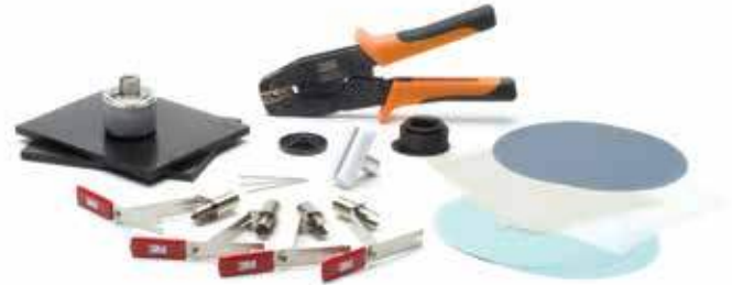
3M™ Hot Melt LC Expansion Kit 6650-LC