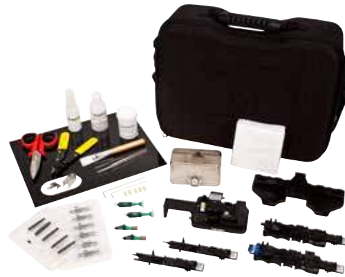
3M™ Fiber Optic Angle Cleave Kit 2565

The 3M™ Fiber Optic Angle Cleave Kit 2565 provides the tools necessary to terminate 3M™ No Polish LC/APC and SC/APC Angle Splice Connectors. The 3M™ Fibrlok™ Angle Splice Assembly Tool 2501-AS is also included to terminate 3M™ Fibrlok™ Angle Splices. Replacement parts are available.