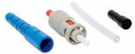
3M™ Crimplok™ ST Connector

By using proven malleable metal element fiber-gripping technology, these connectors are designed to be easily installed virtually anywhere without the need for electrical power.