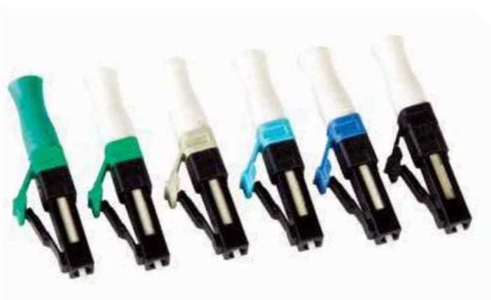
3M™ No Polish LC Connector Family