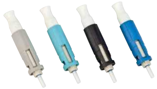
3M™ No Polish ST Connector Family