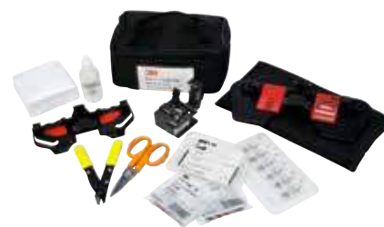
3M™ Fibrlok™ Splice Kit with Cleaver 2559-C

The 3M Fiber Optic Angle Cleaver Kit 2565 provides the tools to terminate the 3M Fibrlok Angle Splice 2529-AS and 2540-AS. Also included in the kits are the 3M No Polish Connector Assembly Tools 8865-AT and 8835-AT for terminating SC and LC angle splice connectors. Replacement parts are available.