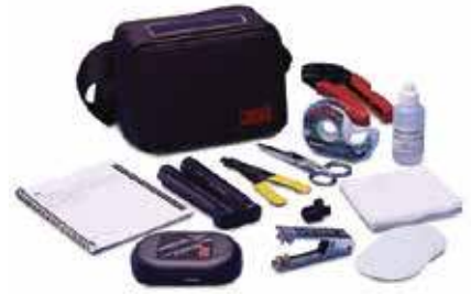
3M™ Crimplok™ Kit 6955 (components displayed)

The Crimplok Termination Kit and accessories provide the tools and materials necessary to terminate 3M™ Crimplok™ Fiber Optic Connectors. Replacement parts are available.