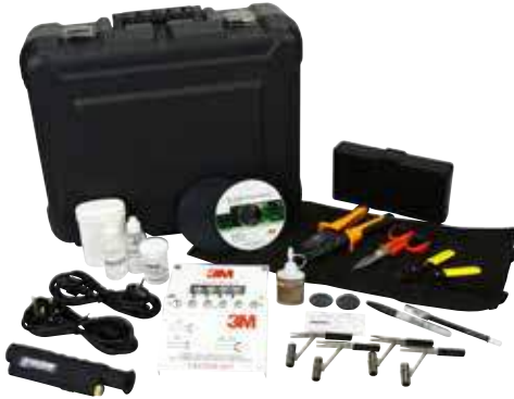
3M™ Hot Melt Termination Kits 6366 and 6362-230V

3M™ Hot Melt Termination Kits 6366 (120V oven) and 6362 (230V oven) contain the tools and materials necessary to terminate 3M™ Hot Melt SC, ST, and FC Connectors, both singlemode and multimode. The 3M™ LC Hot Melt Expansion Kit 6650-LC is used in addition to the 6366/6362 hot melt termination kits to terminate 3M™ Hot Melt LC Connectors.