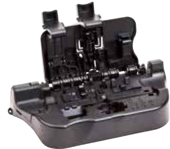
3M™ Easy Cleaver