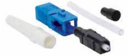
3M™ Hot Melt SC Connector

The 3M Hot Melt LC Connector in both singlemode and multimode has all the advantages of our pre-loaded hot melt technology — and at half the size of our SC connector.