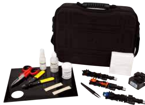
3M™ No Polish Connector Premium Kit with Cleaver 8865-C/PR