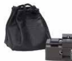
3M™ Cleaver 2534

The 3M Fibrlok Splice Kits for flat splices are available with (2559-C) and without (2559) and contain all the materials needed to terminate 3M™ Fibrlok™ Splices whether it be a singlemode or multimode splice. Detailed instructions are also provided. Included in the kits are the 3M™ Fibrlok™ II Assembly Tool 2501 and 3M™ Fibrlok™ 250 μm Assembly Tool 2504G, simple-to-use tools designed for fast and easy installation.