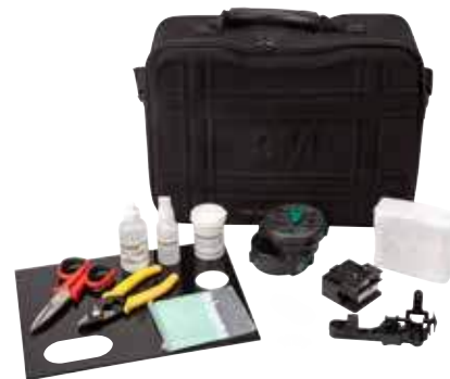
3M™ Crimplok™+ SC/APC Connector Kit 8765T-APC for 3M™ Crimplok™+ Connectors 8700-APC