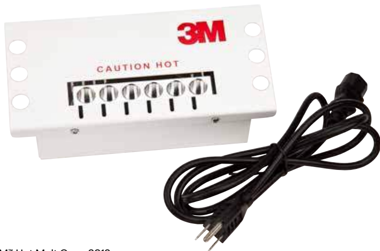
3M™ Hot Melt Oven 6312