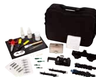
3M™ Fiber Optic Angle Cleaver Kit 2565 includes 3M™ Fiber Optic Angle Cleaver 2535, 3M™ Fibrlok™ Angle Splice Assembly Tool 2501-AS and all tools necessary for 3M™ Fibrlok™ Angle Splices.

The 3M Fiber Optic Angle Cleaver Kit 2565 provides the tools to terminate the 3M Fibrlok Angle Splice 2529-AS and 2540-AS. Also included in the kits are the 3M No Polish Connector Assembly Tools 8865-AT and 8835-AT for terminating SC and LC angle splice connectors. Replacement parts are available.