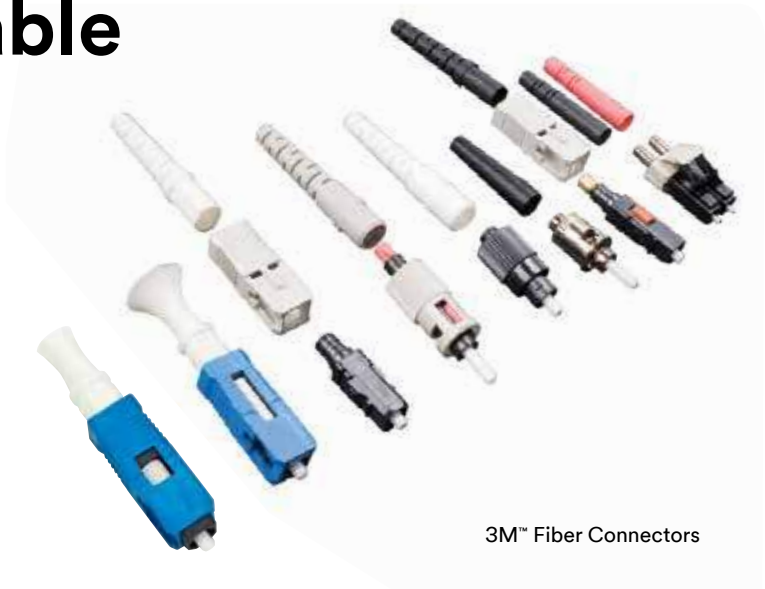
3M™ Fiber Connectors

Reliability and a craft-friendly installations make 3M field installable connectors popular among contractors and industry professionals. 3M connectors can help maximize time in the field with factory-prepped shortcuts and high performance tools. Choose from a full line of fiber connectors with ceramic ferrules.