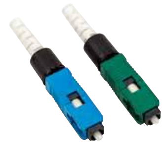
3M™ Crimplok™+ Singlemode Jacketed Connectors