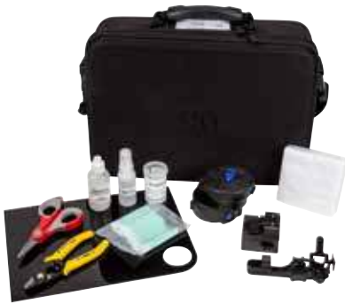
3M™ Crimplok™+ SC/UPC Connector Kit 8765T-UPC for 3M™ Crimplok™+ Connectors 8700-UPC and 6700 Series

3M™ Crimplok™+ Connector Kits 8765T-UPC/8765T-APC provide the tools needed to terminate 3M Crimplok+ Connectors 8700-UPC 6700 and 8700-APC series, respectively. Both kits contain the same fiber preparation tools including a high quality cleaver, a work surface and a case with an integrated hook for easy hanging. Each kit contains a specific 3M™ Crimplok™+ Activation Tool and 3M™ Crimplok™+ Nano Finishing Tool, depending upon the connector type. UPC tools provide a square finish while APC tools provide a 8° angled finish.