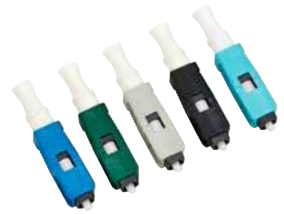
3M™ Crimplok™+ 250μm/900μm Connector Family

Crimplok+ connectors have a thermally balanced design that is tested for premises and FTTP applications for indoor and outdoor conditions.