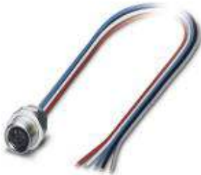
Bus system flush-type plug-in connector, socket, DeviceNet, 5-pos., M8, front/screw mounting with M10 fastening thread, with 0.5 m TPE litz wire, 5 x 0.25 mm²

Please be informed that the data shown in this PDF Document is generated from our Online Catalog. Please find the complete data in the user's documentation. Our General Terms of Use for Downloads are valid ( http://download.phoenixcontact.com )