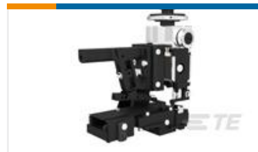
TE Part #2151496-1 OCEAN_2.0_APPLICATION-S-055F062O