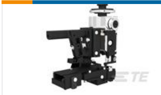
TE Part #2266118-1 OCEAN_2.0_APPLICATION-S-069F080O