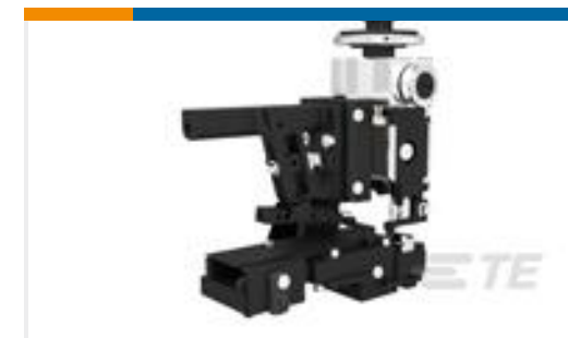
TE Part #2266110-1 OCEAN_2.0_APPLICATION-S-074F068O