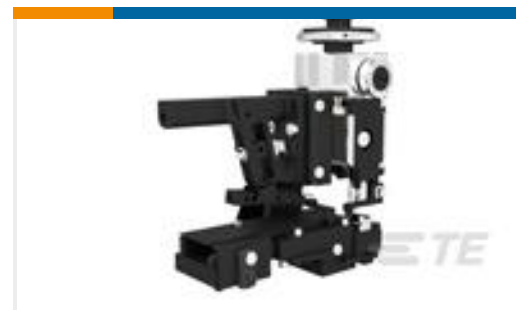
TE Part #2266103-1 OCEAN-2.0-APPLICATION-S-090F080O