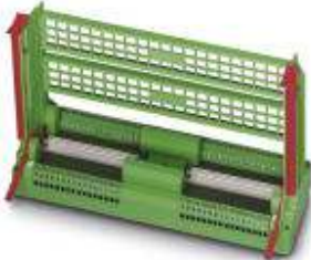
Plug-in card block, Pitch: 0 mm, Connection method: Screw connection, Contact surface: Tin

Please be informed that the data shown in this PDF Document is generated from our Online Catalog. Please find the complete data in the user's documentation. Our General Terms of Use for Downloads are valid ( http://phoenixcontact.com/download )