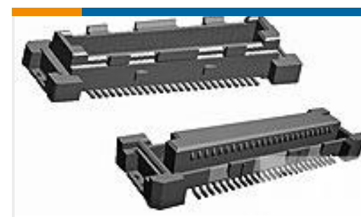
TE Part #5353190-8 .6FHR04H,100,S,GIG,08/Sn,TR,NSYes