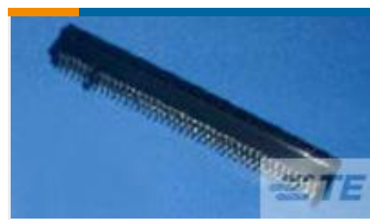
TE Part #5145154-8 STANDARD EDGE .050 SERIES 60 DUAL ASSY