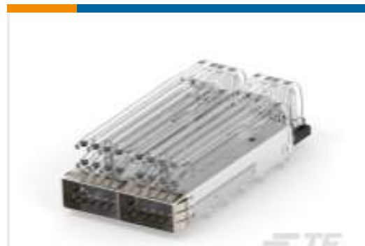
TE Part #2344878-1 CAGE ASSEMBLY, 1X2, QSFP28, SPRING, 8LP