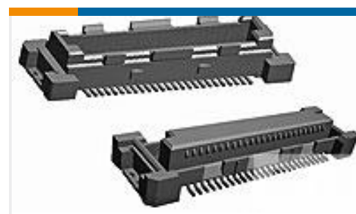
TE Part #5353831-8 .6FHP07H,100,S,GIG,08/Sn,TR,NSYes