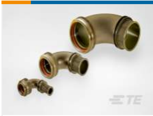
TE Part #AAF7089-00 BTH3-23-17-1-B-SE