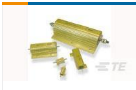
TE Part #1-1625966-7 HSA10 1R5 5%