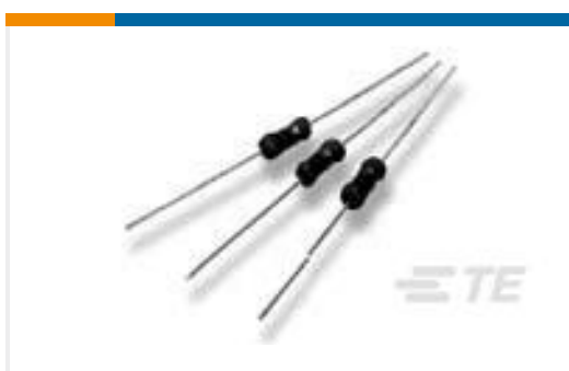
TE Part #1-1879354-1 RR03 5% R82 AMMO