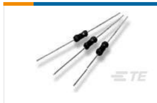
TE Part #2-1879354-4 RR03 5% 3R0 AMMO