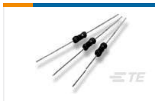
TE Part #1879354-7 RR03 5% R56 AMMO