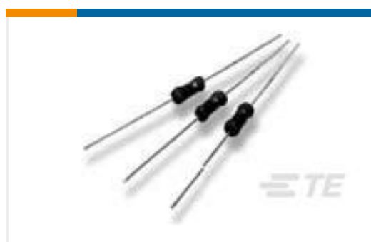
TE Part #1-1879354-2 RR03 5% R91 AMMO