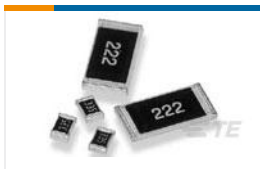
TE Part #1623112-1 CRG0805 1% 13K