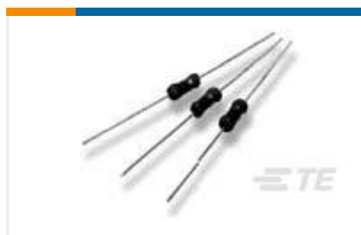
TE Part #3-1879354-4 RR03 5% 7R5 AMMO