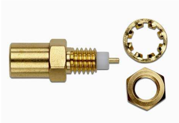
Model 72999 SMB PLUG PANEL RECEPTACLE

Snap-on coupling and small size for fast connect and disconnect.