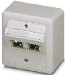
Terminal outlet, surface mounting, IP20, two slots for contact inserts with the Freenet system

Please be informed that the data shown in this PDF Document is generated from our Online Catalog. Please find the complete data in the user's documentation. Our General Terms of Use for Downloads are valid ( http://phoenixcontact.com/download )