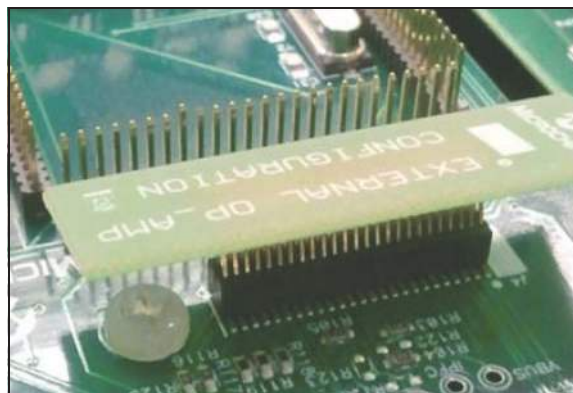
FIGURE 2: EXTERNAL OP AMP CONFIGURATION BOARD

Table 1 provides information on the hardware versions of the motor control boards that are compatible with this PIM. Refer to the user's guide of the specific motor control board to find information related to hardware version identification.