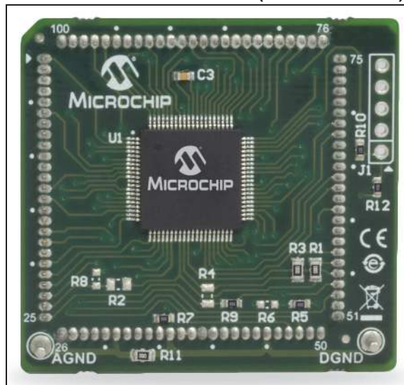
FIGURE 1: dsPIC33CH512MP508 MOTOR CONTROL PIM (P/N: MA330045)

Table 1 provides information on the hardware versions of the motor control boards that are compatible with this PIM. Refer to the user's guide of the specific motor control board to find information related to hardware version identification.