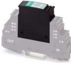
Surge protection plug for base element, for protecting a double conductor of analog telecommunication interfaces.

Please be informed that the data shown in this PDF Document is generated from our Online Catalog. Please find the complete data in the user's documentation. Our General Terms of Use for Downloads are valid ( http://download.phoenixcontact.com )