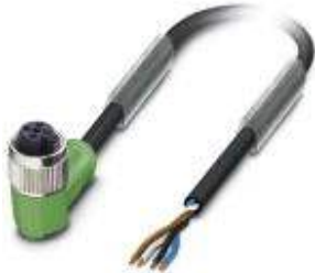
Sensor/Actuator cable, 4-position, PUR, Yellow RAL 1021, Free cable end, on Socket angled M12, Cable length: 5 m

Please be informed that the data shown in this PDF Document is generated from our Online Catalog. Please find the complete data in the user's documentation. Our General Terms of Use for Downloads are valid ( http://download.phoenixcontact.com )